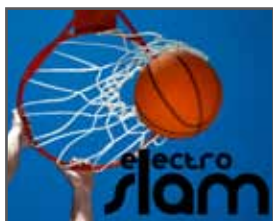
Electroslam: Grip (The Strangers - Black/Cornwell/Burnell/Greenfield)

Girl punk attitude, rock guitars and slamming beats? It must be Electroslam. Cruising the seedy nightlife of King Cross in Sydney, Electroslam site their influences as dirty martinis, strip clubs and 24 hour bars. All they wanna do is play some rock n roll.