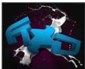
Fixd: This Is Not Electro (Diesel Laws/Danny Silver)

Cracking electro with colour. Fixd will shoot you higher than the clouds, and then drop you like a big bass anvil into the middle of the dancefloor. Get moving! www.fixdmusic.com